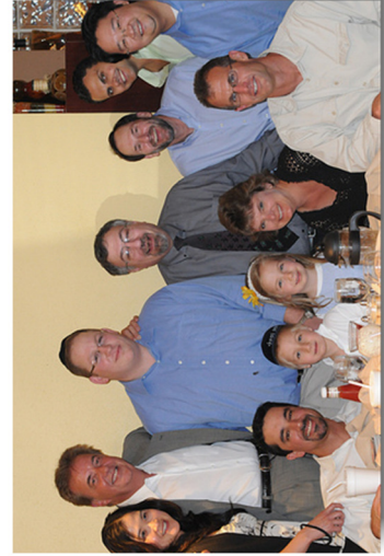
Graduation Dinner, 2010